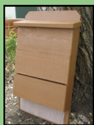
Bat Boxes (Single- or Double-Chamber)