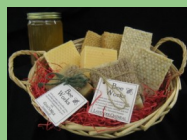
Bee Works Handmade Soap