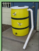
Rain Water Collection Barrels