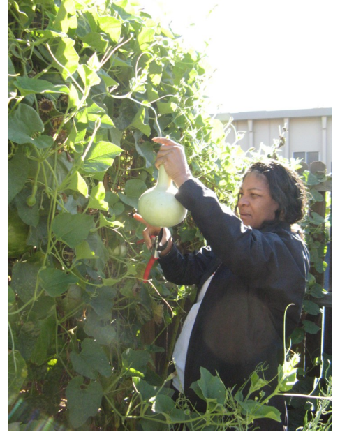
Harvesting gourds in Autumn 2010

2010 saw EarthLinks concentrating our efforts on the workshop, where 61 unique individuals worked in our garden, created glass and paper crafts, raised and tended bees, learned worm composting, painted rain collection barrels, helped build bee and bat boxes, created jewelry, and all the while supported one another and built a community. The connections formed in the workshop: to Earth, to one another, to society, are what set EarthLinks apart from other non-profits. We take "going Green" seriously, and have for 15 years. Our participants bring compost to our garden on the bus, care for our bees and learn Earth care. Resources are shared and community is formed. Our third Floral Design Course graduated 11 women fully trained to obtain work in the floral industry. Last year 6 of these graduates obtained full or part-time work, after paid internships.