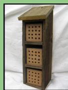
Mason Bee Boxes