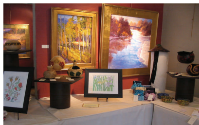
Works displayed at the Standing Sun Fine Art Gallery April 30, 2009